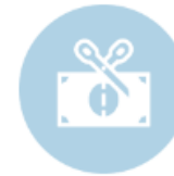
Accumulation and Redemption of Retirement Capital 2018 Plan (2018)